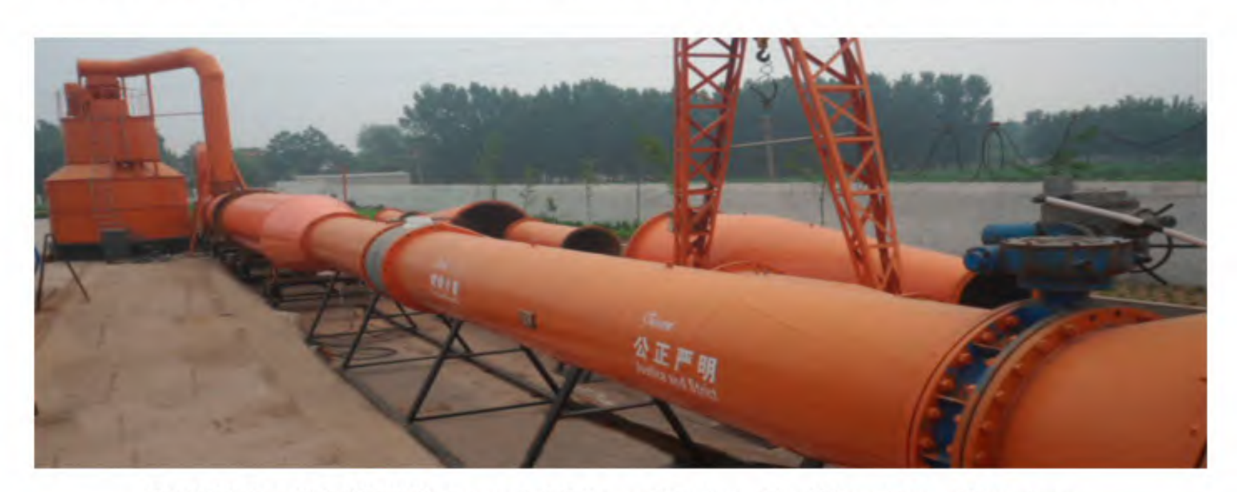
DN800 ~DN3000 Liquid Flow Meter Calibration Device