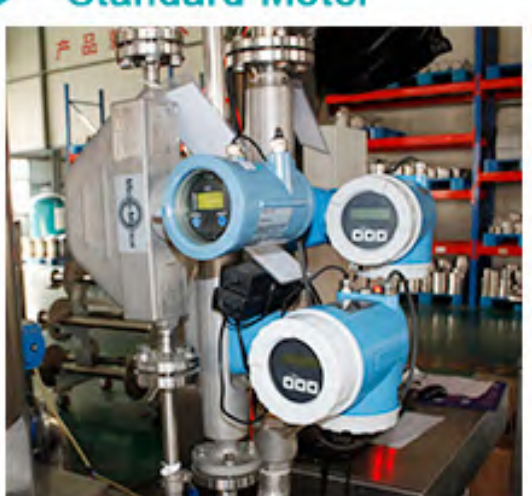
DN15-50 Gravimetric & Standard Meter Liquid Flow Meter Calibration Device