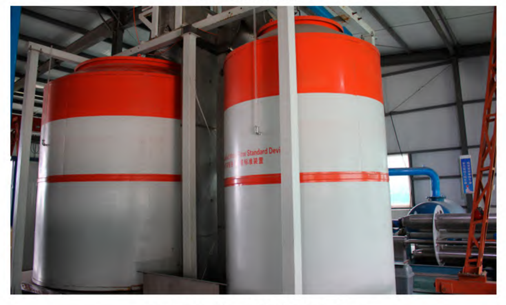
DN350-DN700 &DN65-DN300 0.1 % Weighing and volumetric device to ensure accurate calibration